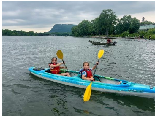
Otterburn Park Canoe Club Outing, June 2025