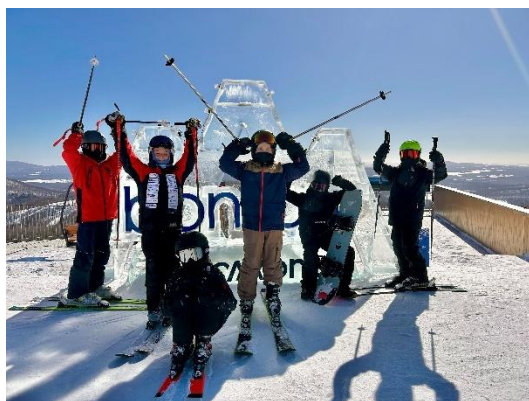
Grade 5 and 6 students at Bromont