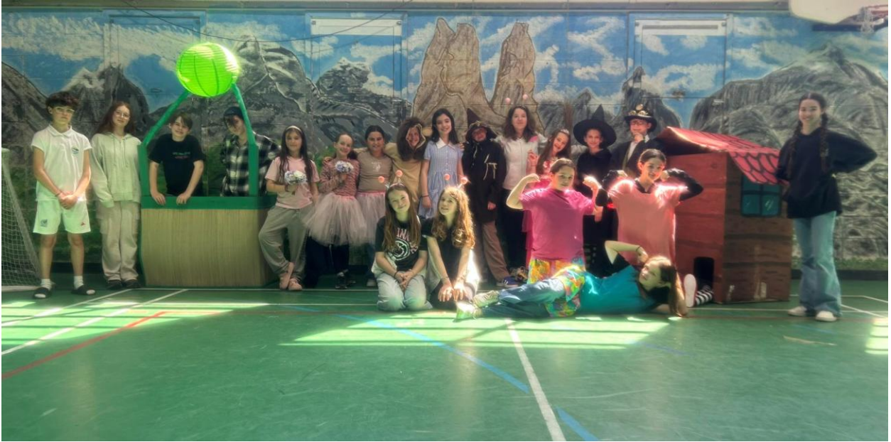
The cast of The Wizard of Oz, April 2025