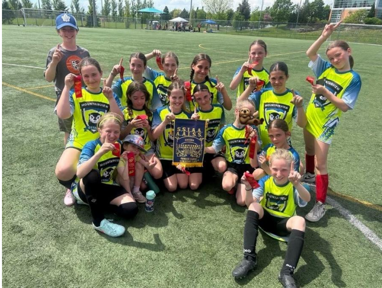
Female SSIAA Soccer, Mountainview wins the championship!