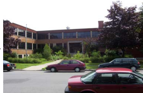
Saint-Lambert Elementary School